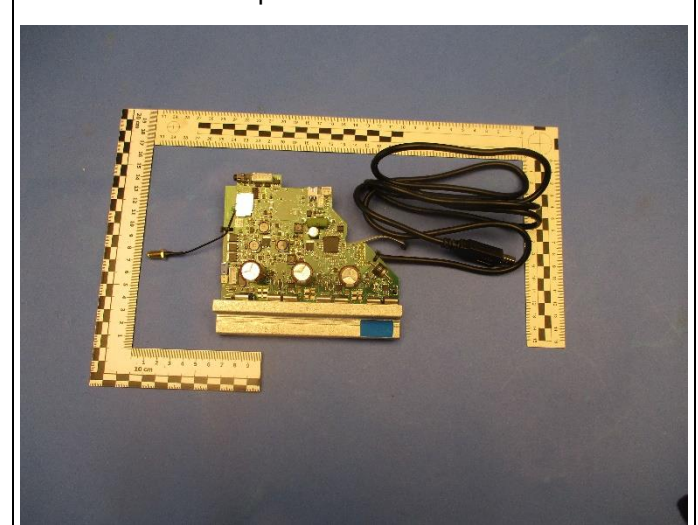
Conducted test set up