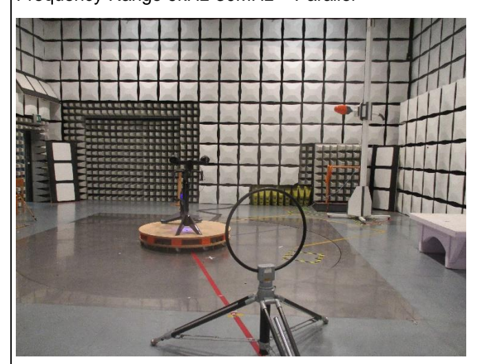
Frequency Range 9kHz-30MHz - Parallel