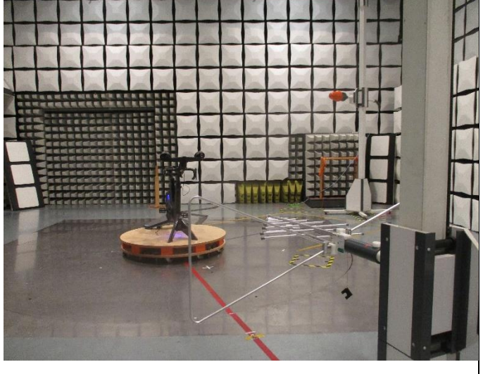
Frequency Range 30MHz -1GHz, Downhill Mode