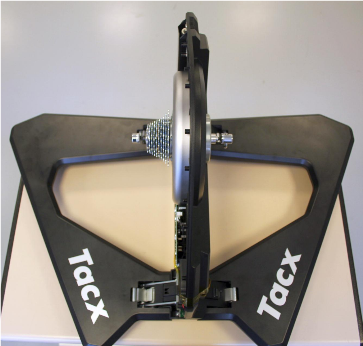
Top view with brand marking (note: left cover is missing)