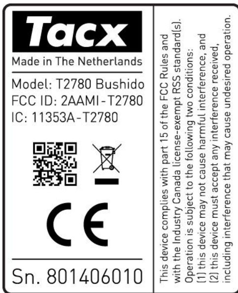
Future label, second batch. This label will be used when the batch of the first labels have run out. Product label and warning label are combined in this future label.