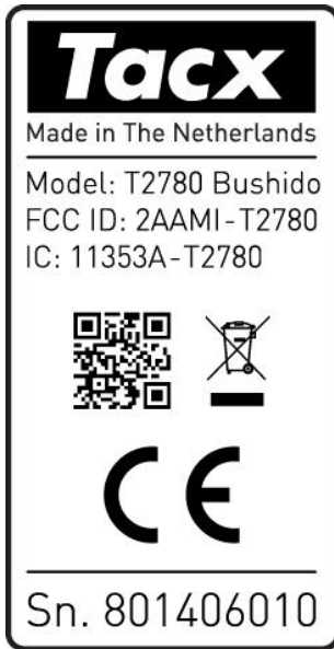
Label info, First batch

This device complies with part 15 of the FCC Rules and with the Industry Canada license-exempt RSS standard(s). Operation is subject to the following two conditions: (1) this device may not cause harmful interference, and (2) this device must accept any interference received, including interference that may cause undesired operation.