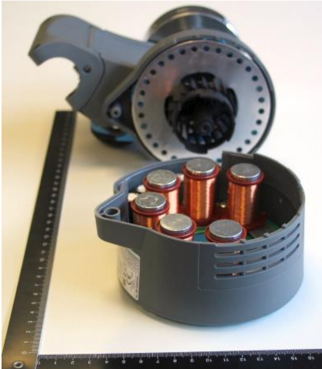
Left side, holding the transmitters (cover removed)