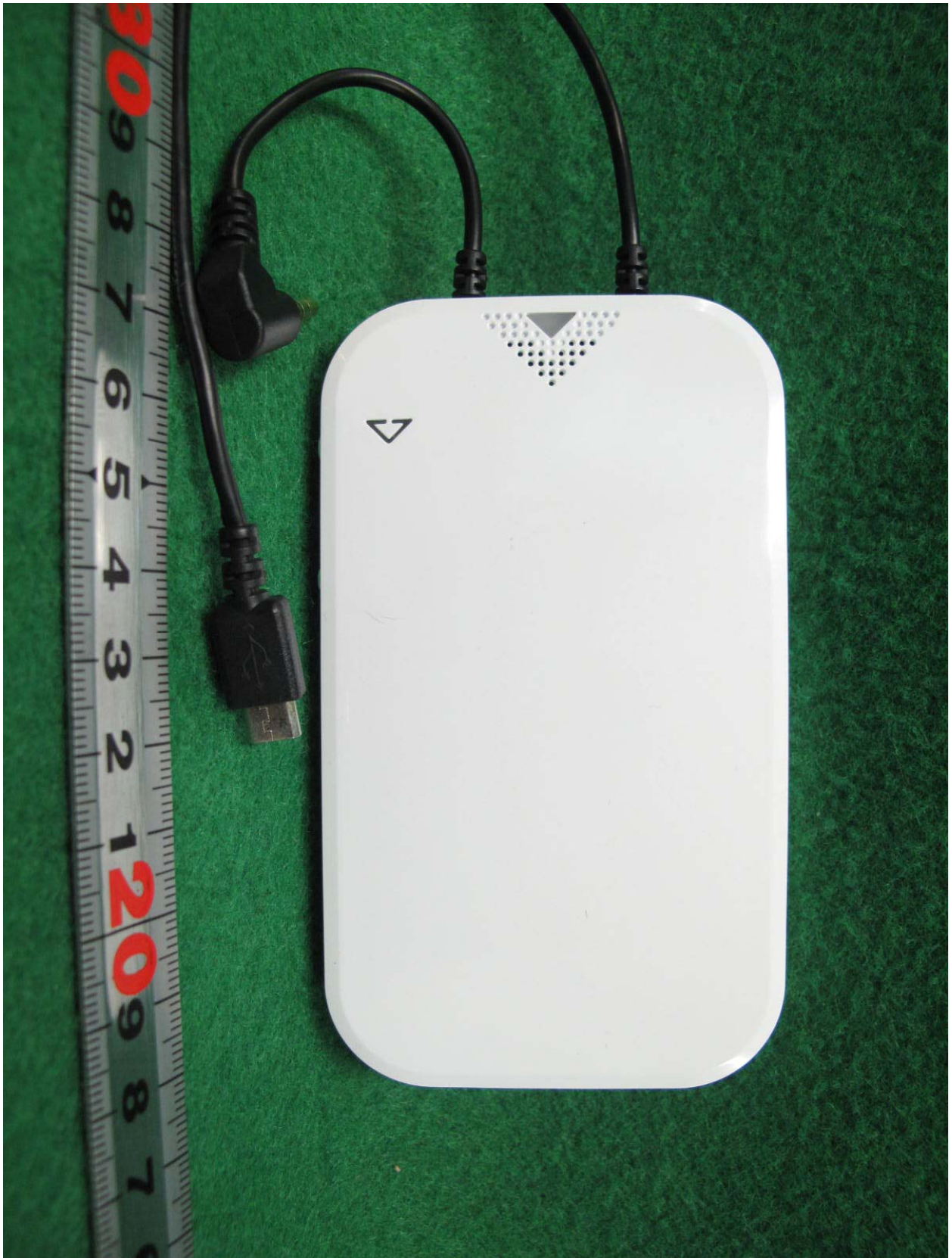
Front Side View of EUT