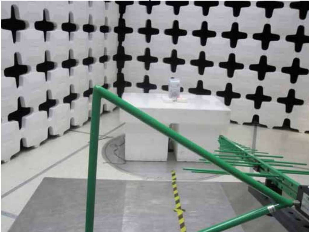
Test Setup for Radiated Emissions, 30MHz to 1GHz – Horizontal Polarization