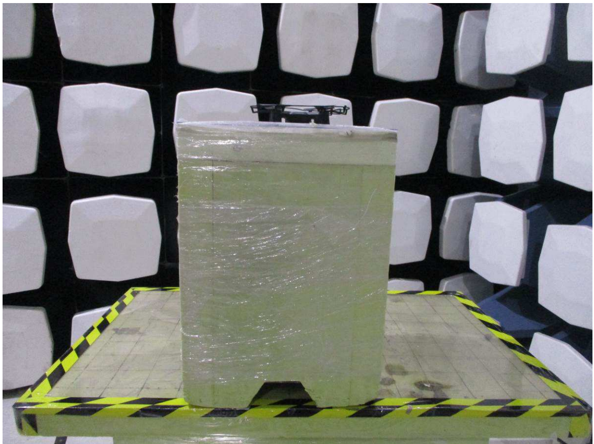
Above 1GHz (The EUT placed at the center of the turntable)