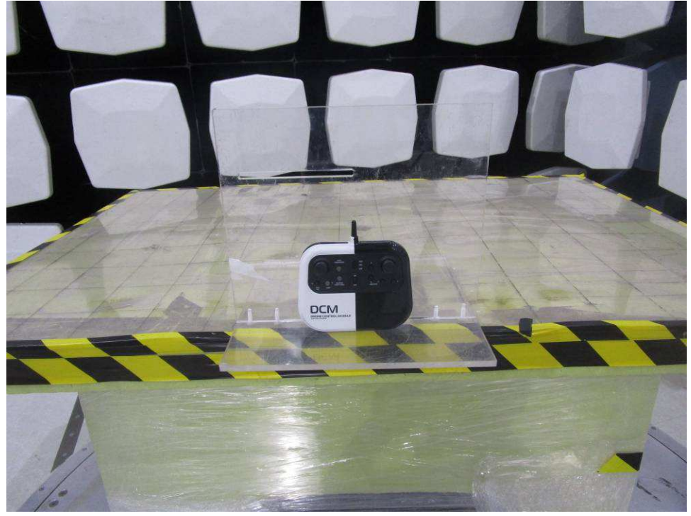
Up to 1GHz (EUT was placed at the centre of the turntable)