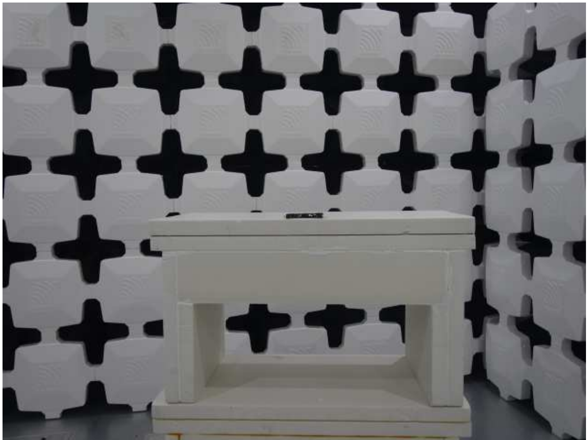
Above 1GHz (The EuT placed at the center of the turntable)