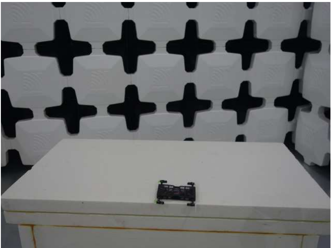
Up to 1GHz (The EuT placed at the center of the turntable)