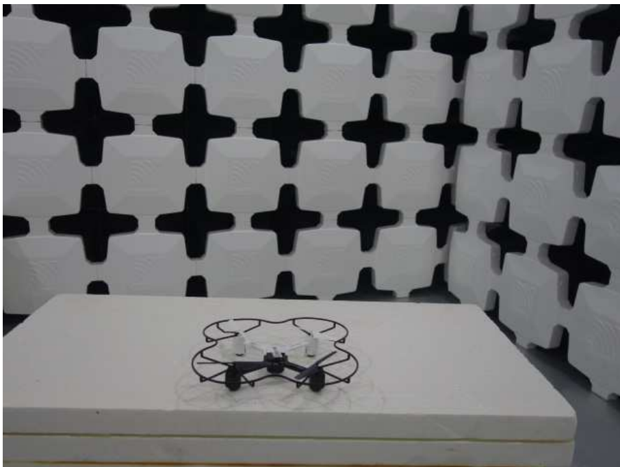
Up to 1GHz (The EuT placed at the center of the turntable)