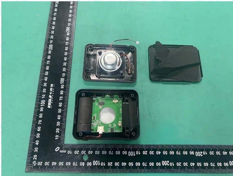
Photo 7 Internal of EUT