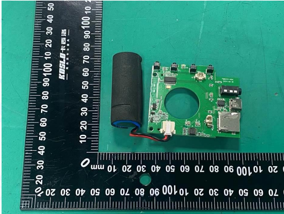
Photo 9 Internal of Battery