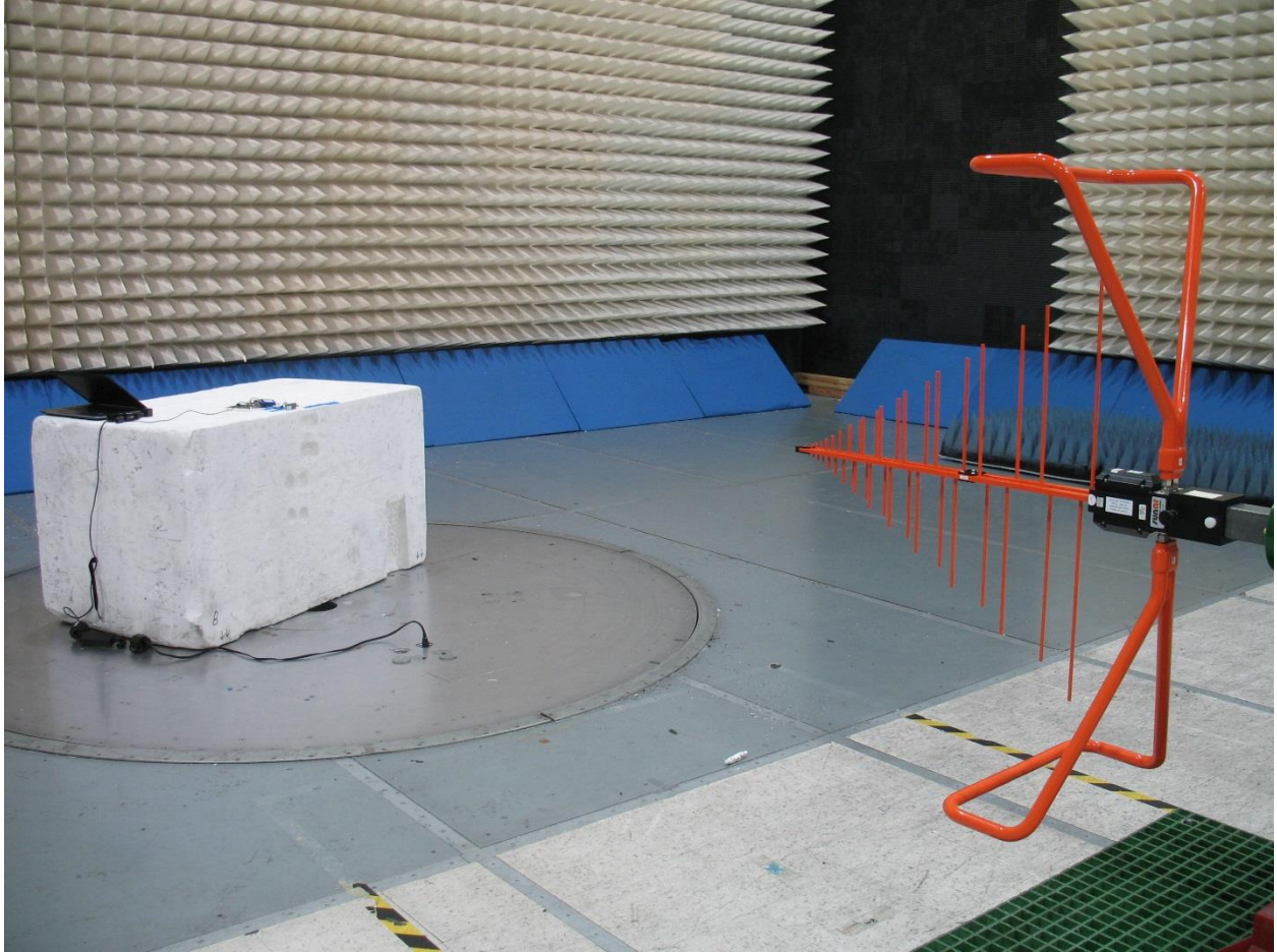
Radiated Emissions (below 1 GHz)