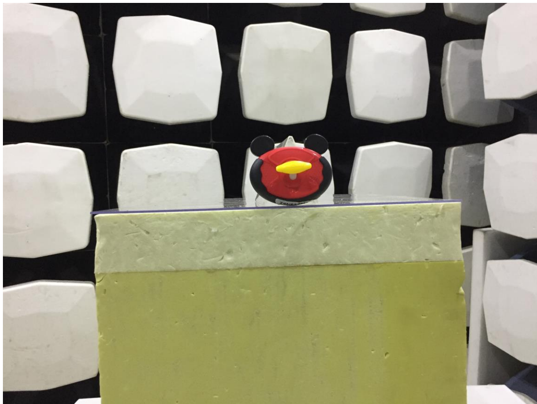
Above 1GHz (The EUT placed at the center of the turntable)