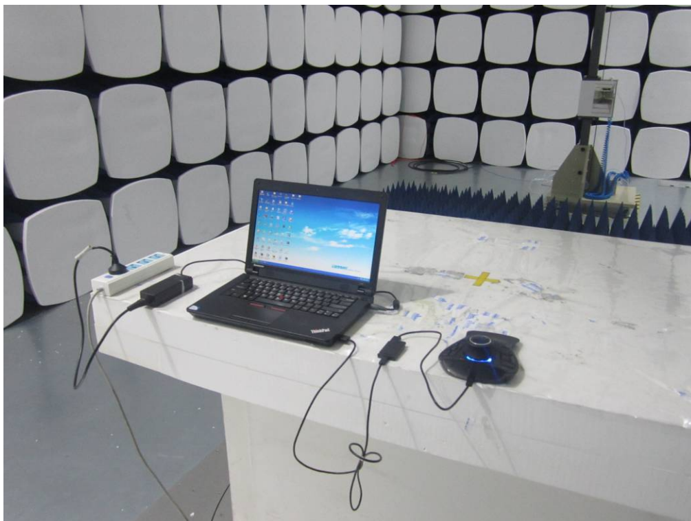
Radiated Spurious Emissions Test Setup Above 1GHz –Front View (3Dconnexion USB HUB(Model:3DX-600049) has been tested)