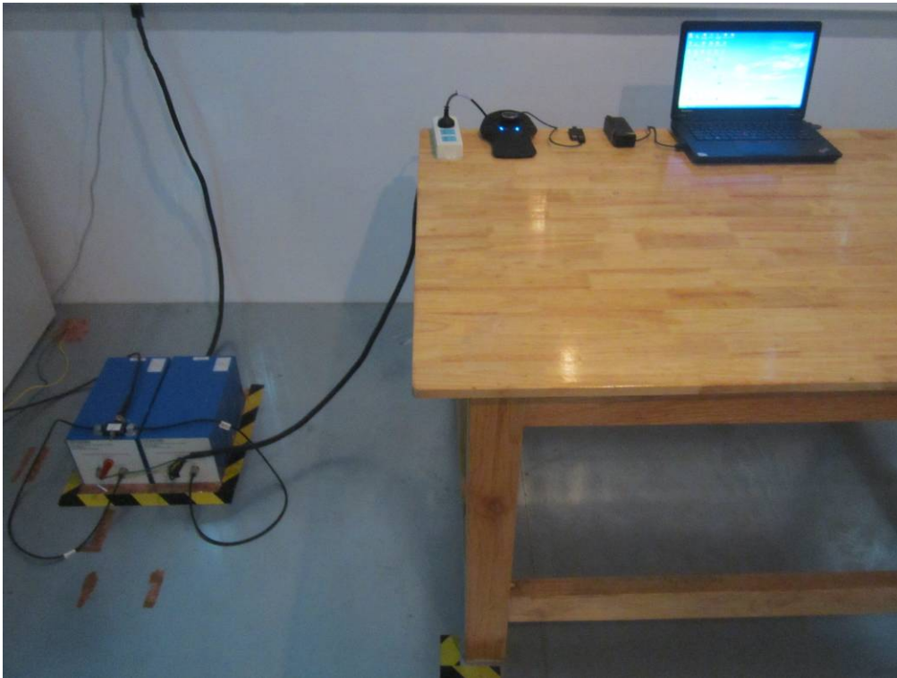
Conducted Emissions Test Setup Front View (3Dconnexion USB HUB(Model:3DX-600049) has been tested)