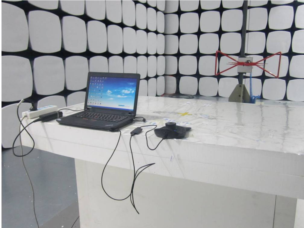
Radiated Spurious Emissions Test Setup Below 1GHz - Front View (3Dconnexion USB HUB(Model:3DX-600049) has been tested)

Report No.: 14070248-FCC-E1 Issue Date: June 18, 2014 Page: 35 of 41 www.siemic.com www.siemic.com.cn