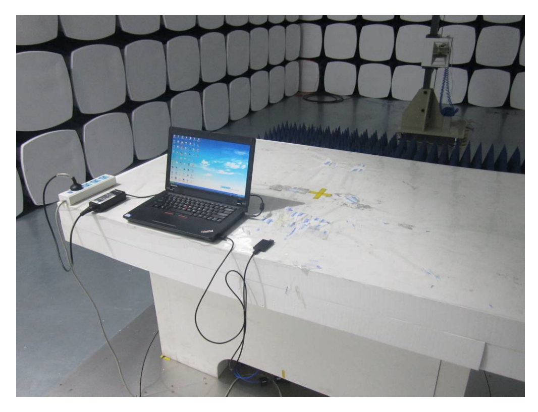
Radiated Spurious Emissions Test Setup Above 1GHz –Front View (3Dconnexion USB HUB(Model:3DX-600049) has been tested)