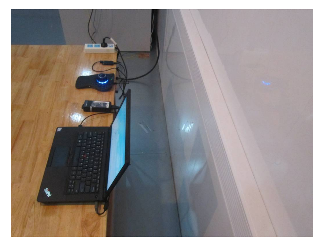
Conducted Emissions Test Setup Side View (3Dconnexion USB HUB(Model:3DX-600049) has been tested)