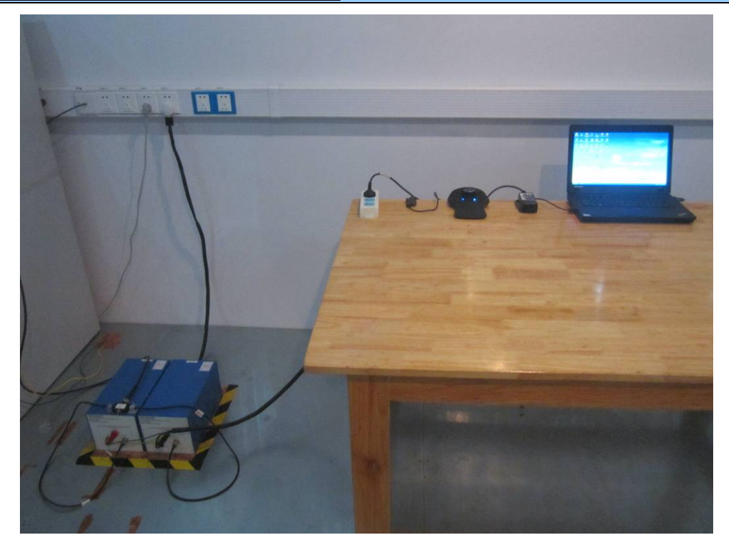
Conducted Emissions Test Setup Front View (3Dconnexion USB HUB(Model:3DX-600049) has been tested)