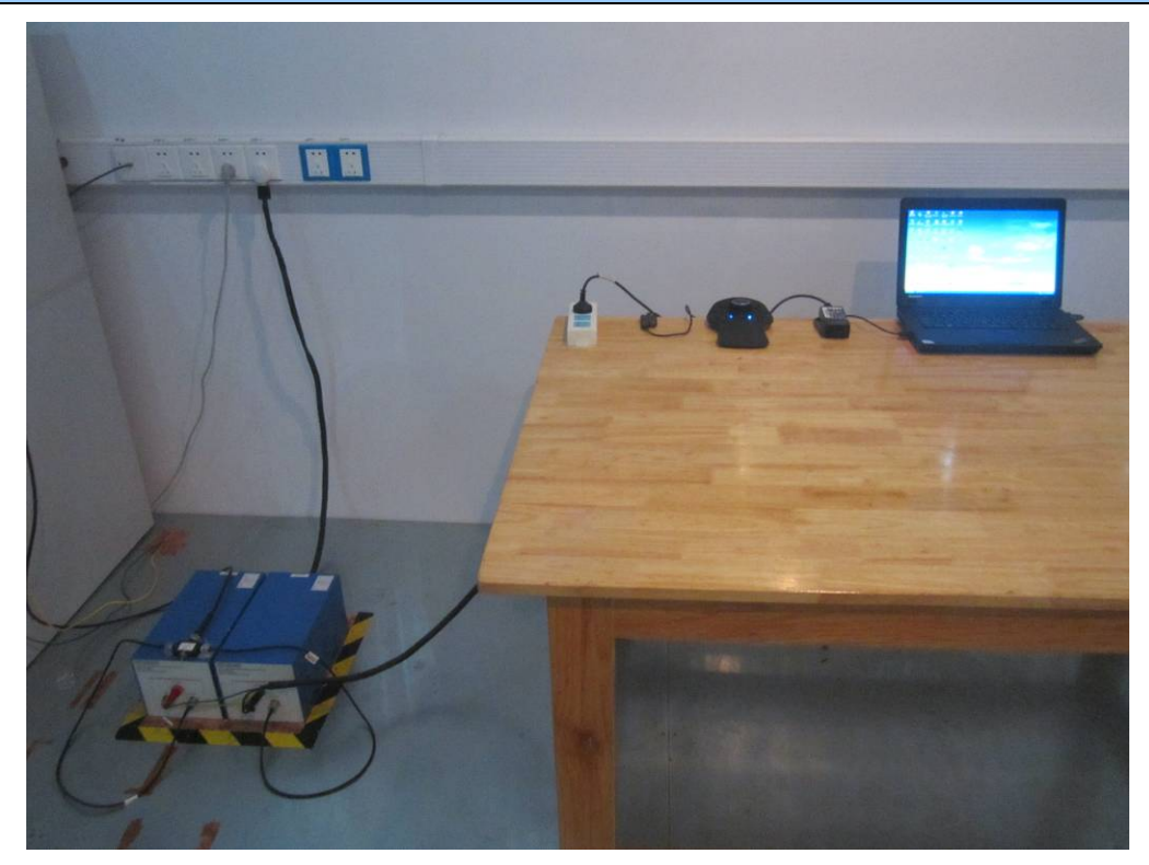
Conducted Emissions Test Setup Front View (3Dconnexion USB HUB(Model:3DX-600049) has been tested)