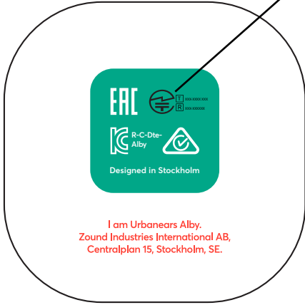
Back of case.