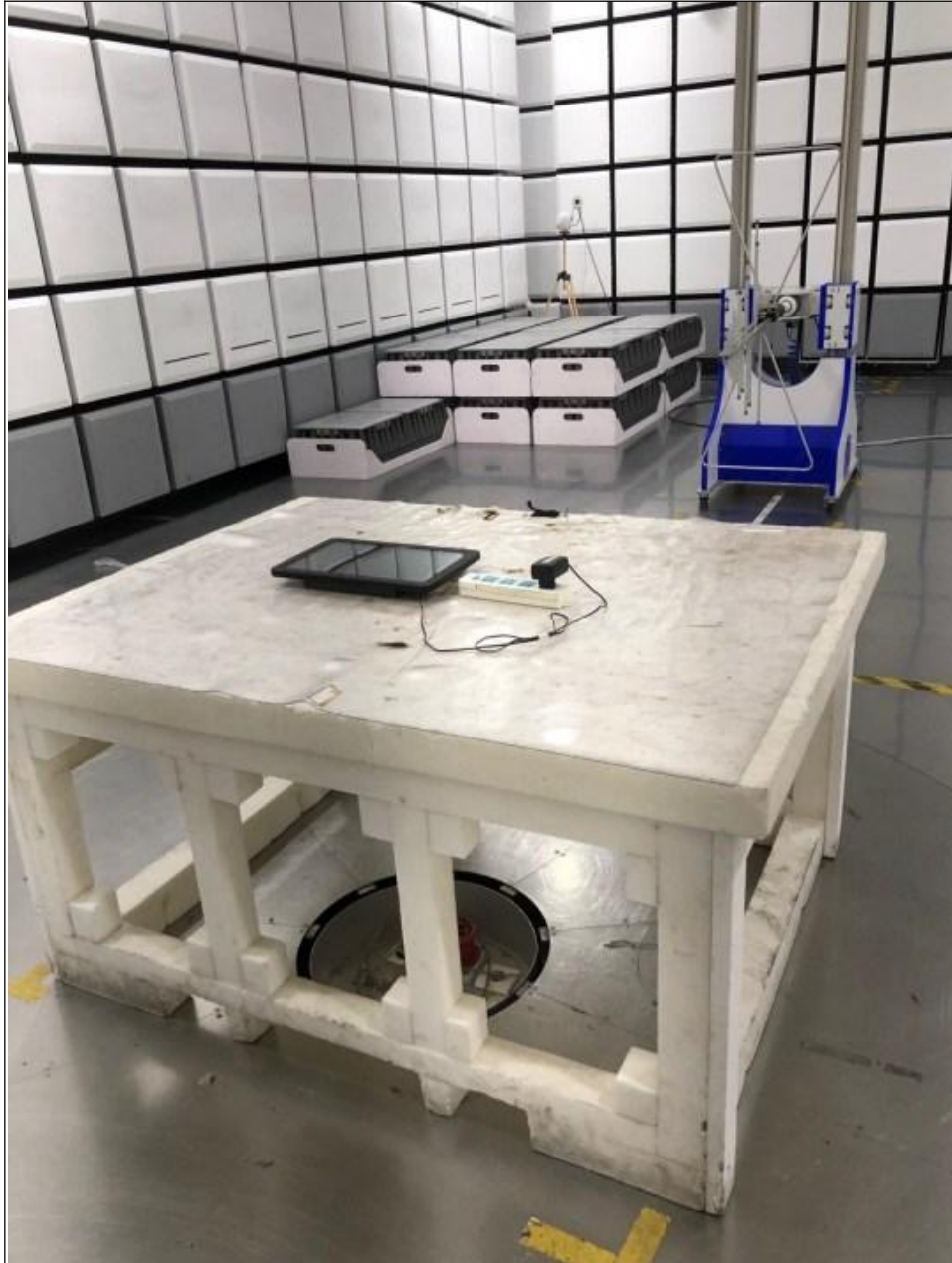
Frequency Range < 30MHz~1GHz >