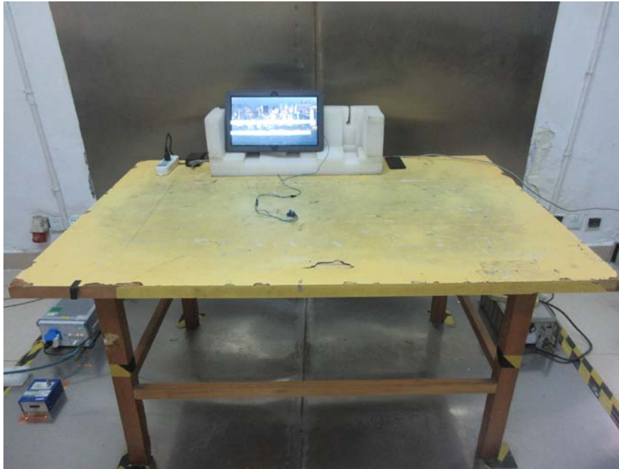
Conducted Emission Rear View