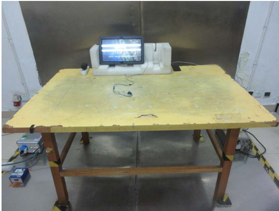
Conducted Emission Rear View