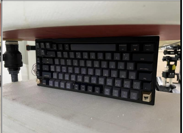
Bottom Side of EUT with 0 cm Gap