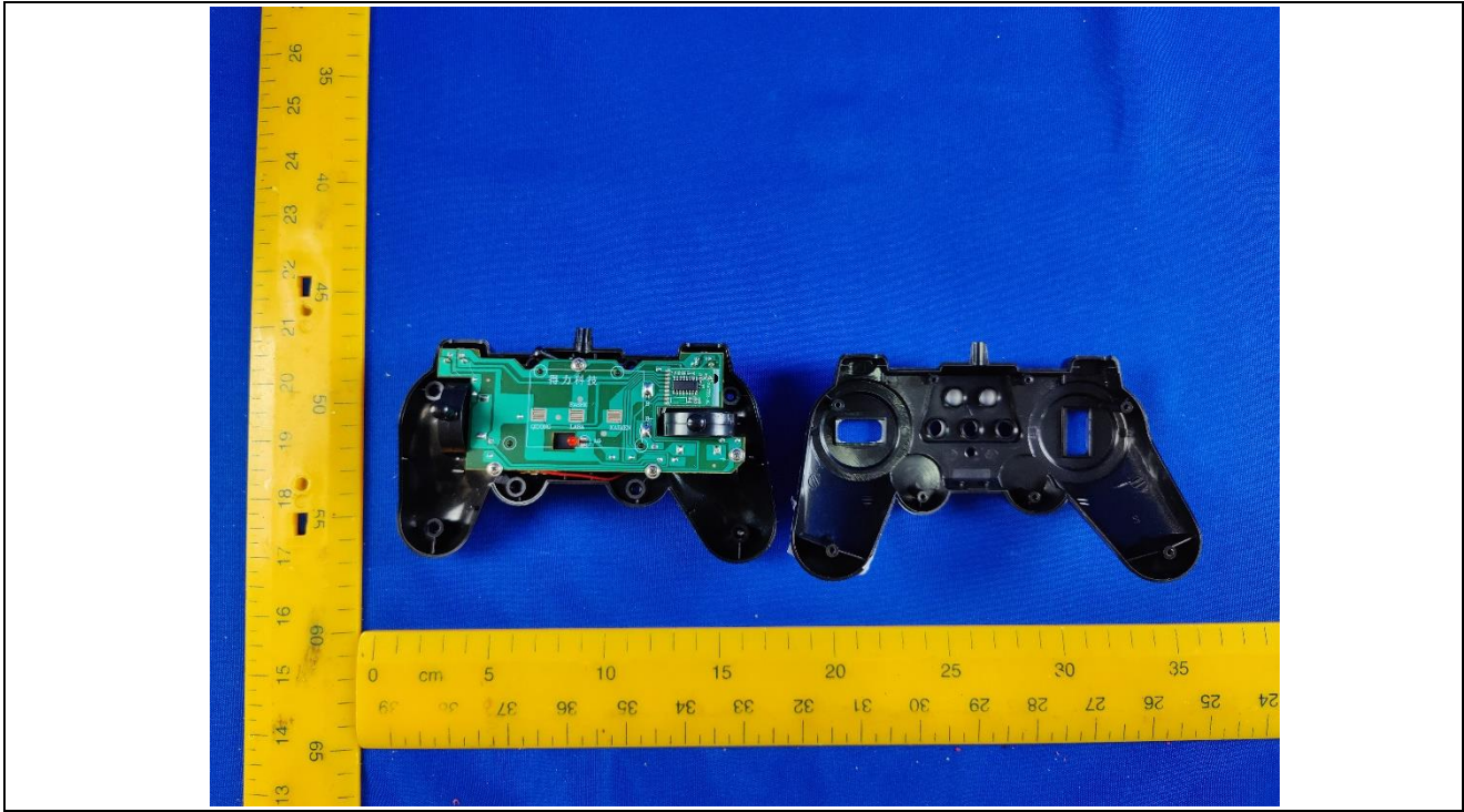
Details of: PCB view for remote controller