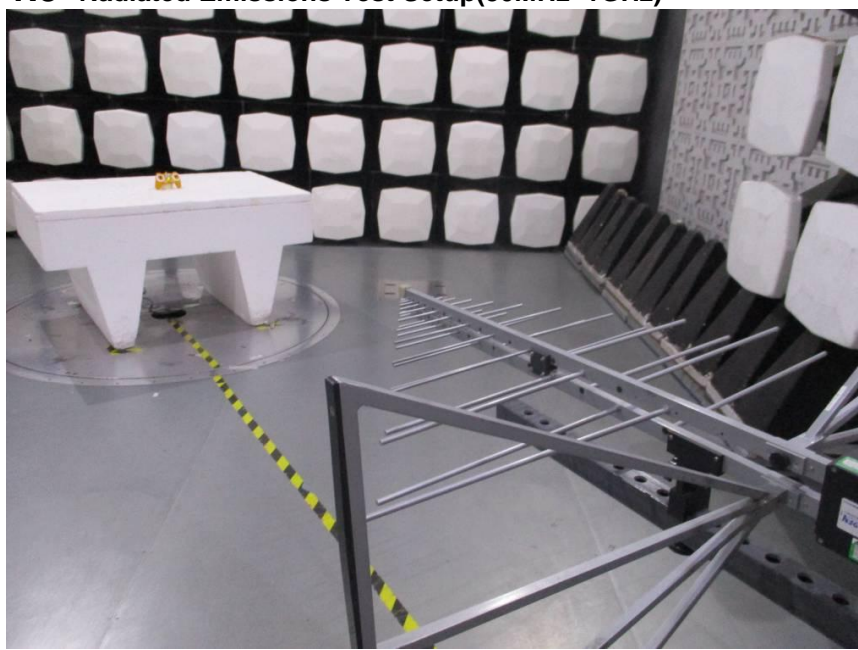
1.4 Radiated Emissions Test Setup(Above 1GHz)

1.3 Radiated Emissions Test Setup(30MHz~1GHz)