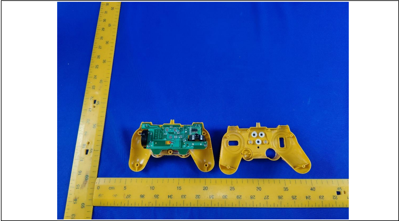
Details of: PCB view for remote controller (all models)