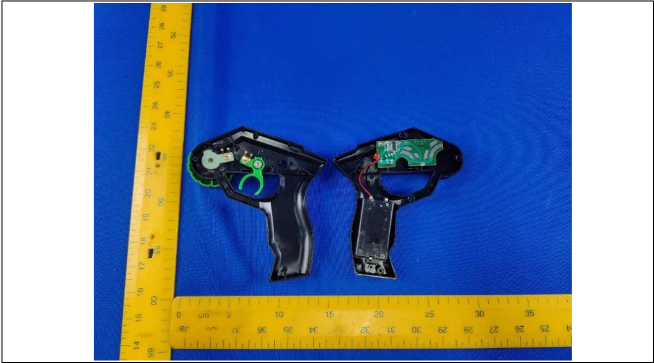
Details of: PCB view for remote controller