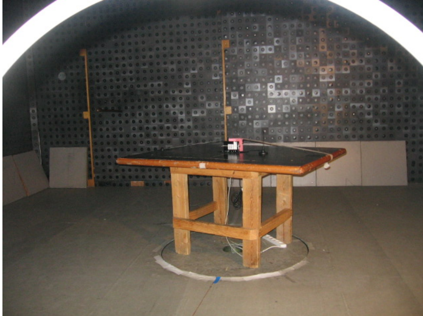
Photograph No.1 Setup for spurious emission field strength measurements in the anechoic chamber below 30 MHz