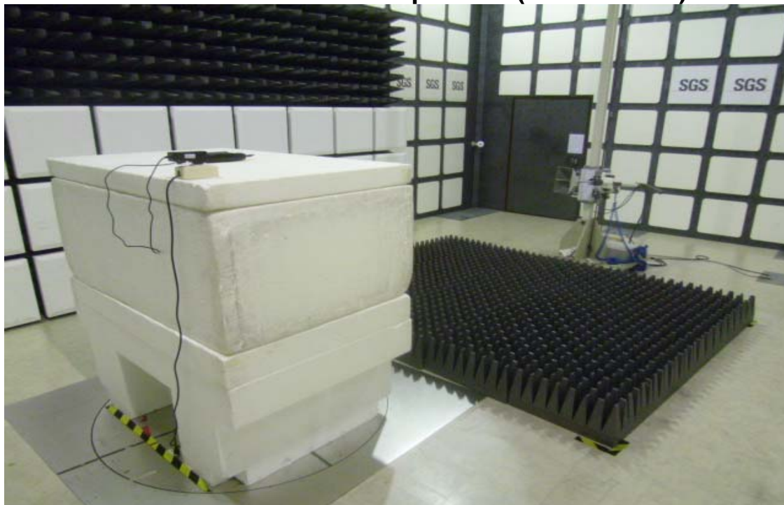
Radiated Emission Set up Photo (Front View)