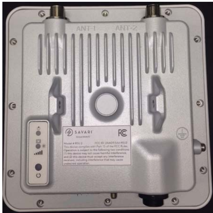
EXTERNAL LABEL LOCATION. REAR OF UNIT.