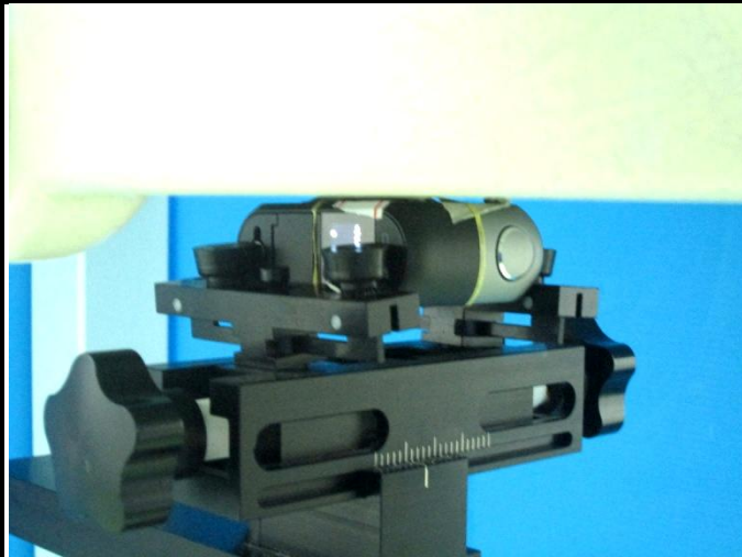
Front Face of EUT with 0 cm Gap