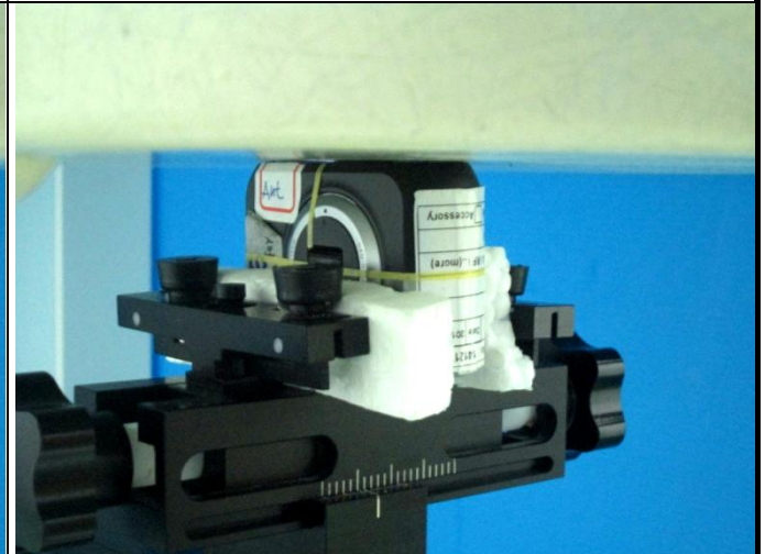
Bottom Side of EUT with 0 cm Gap