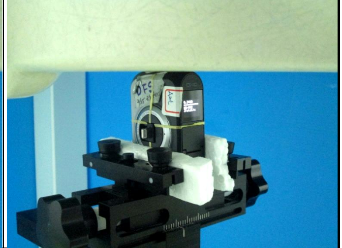
Right Side of EUT with 0 cm Gap