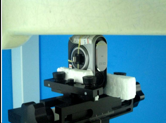
Left Side of EUT with 0 cm Gap