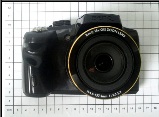
EUT – Front View