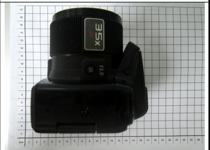
EUT – Right Side View