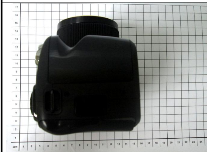
EUT – Left Side View