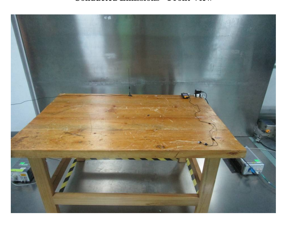
Conducted Emissions – Side View