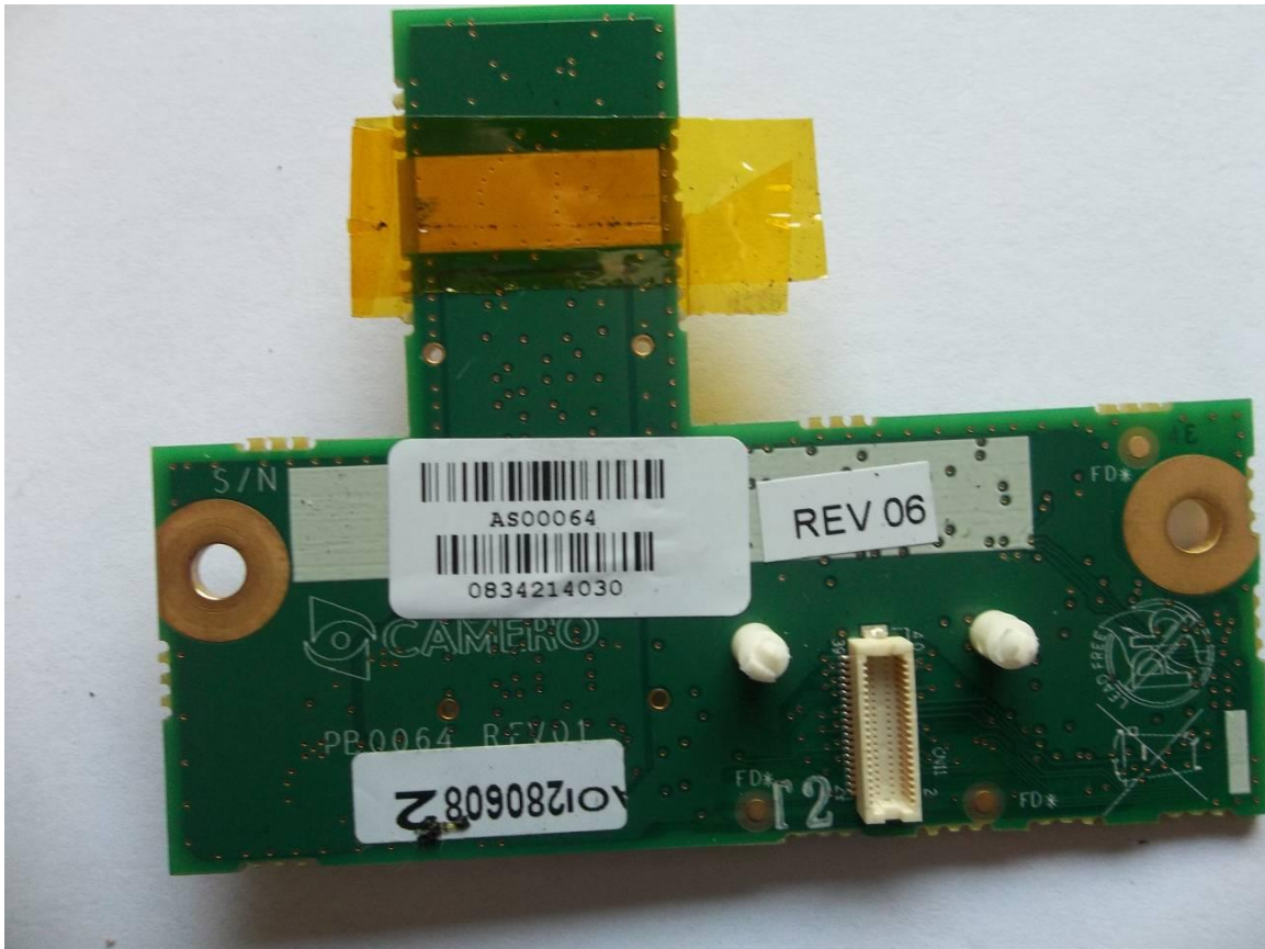
Figure 2. Solder Side of EUT

FCC Part 15 Certification 2AACLX400FWM 15-0221 October 19, 2015 Camera tech Xaver 400 Wireless Module