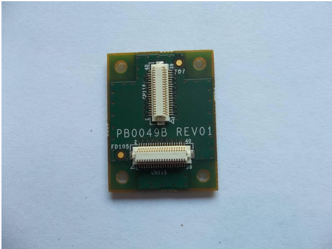
Figure 3. EUT Bridging PCB used to Connect EUT to Host PCB

FCC Part 15 Certification 2AACLX400FWM 15-0221 October 19, 2015 Camera tech Xaver 400 Wireless Module