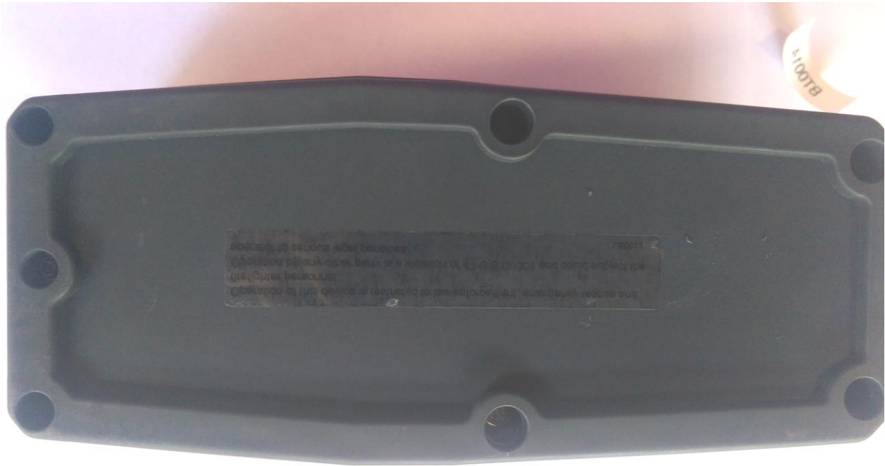
Figure 1. Statement Location on EUT (see close up of label on next page)