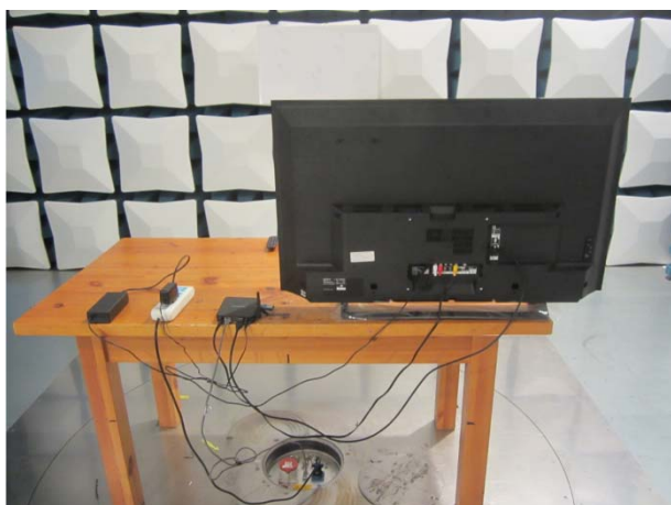
AC Power Line Conducted Emission