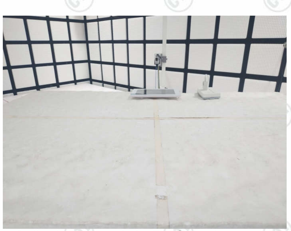
Radiated spurious emission Test Setup-4(Above 18GHz)