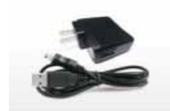
The USB charger

Attachment: hang rope and an external antenna base (optional), PPT receiver (optional), warranty CARDS, manuals, certificates