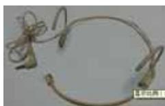
Headset microphone (optional)