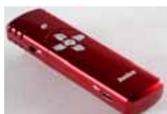
2.4 G digital wireless microphone