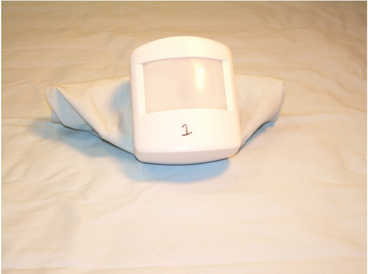
Front View of the EUT