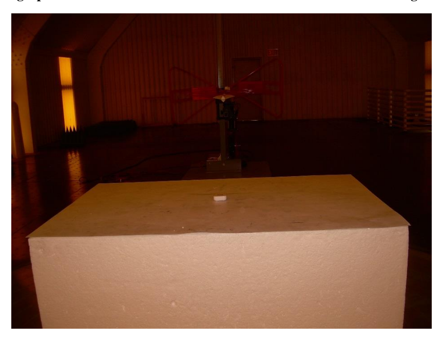
Photograph 2 – Back View Radiated Emissions – 30 MHz to 1000 MHz Configuration