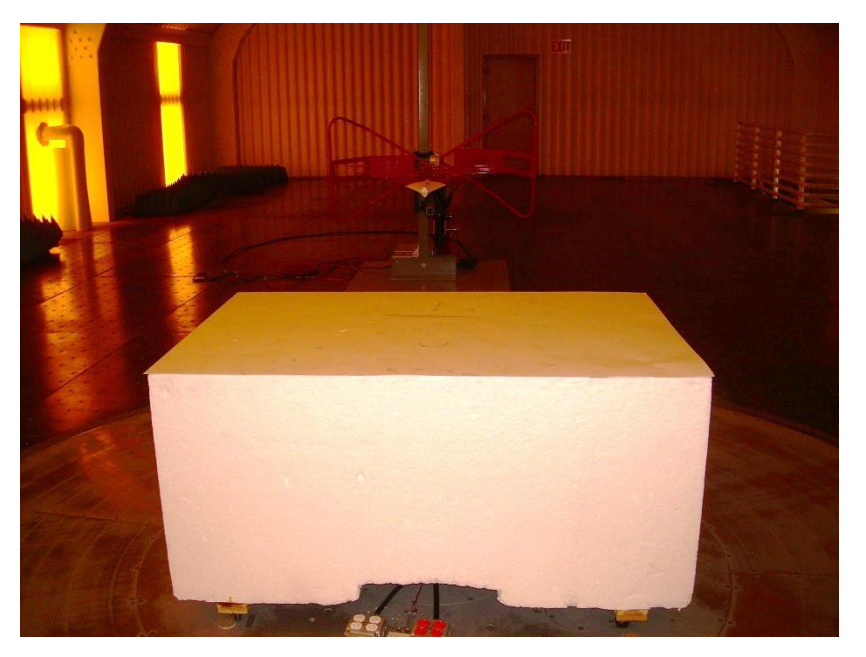
Photograph 6: Test Setup for Emission from 30 MHz to 1000 MHz