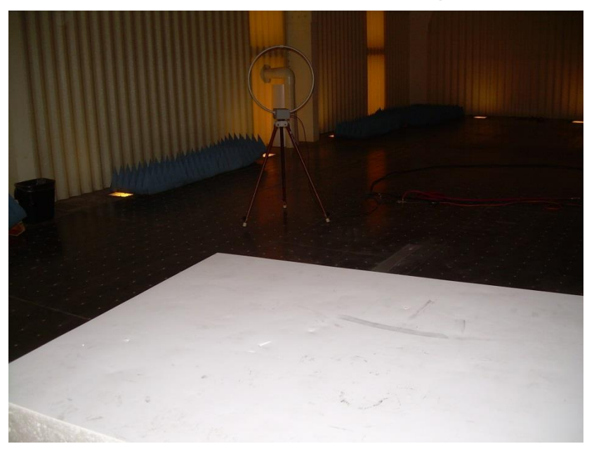
Photograph 5: Test Setup for Emissions Below 30 MHz