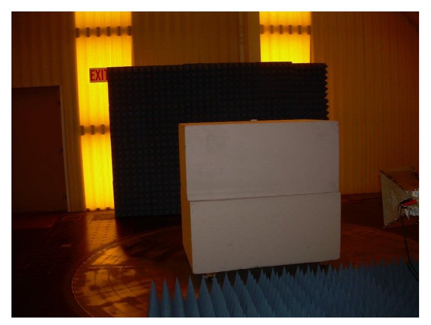
Photograph 3 – Front View Radiated Emissions – Above 1000 MHz Configuration