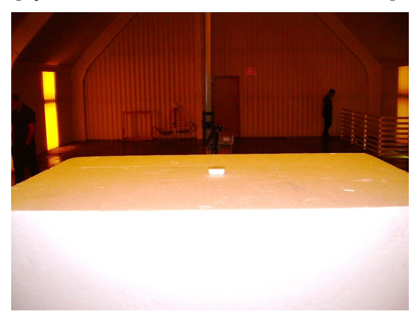
Photograph 4 – Back View Radiated Emissions – Above 1000 MHz Configuration