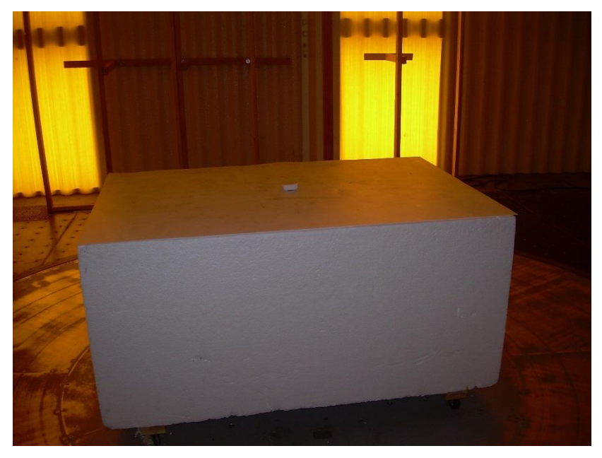
Photograph 1 – Front View Radiated Emissions – Below 1000 MHz Configuration