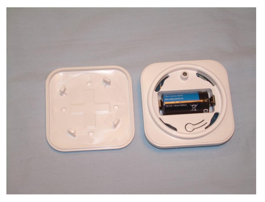
Photograph 1 – Top Removed from the EUT