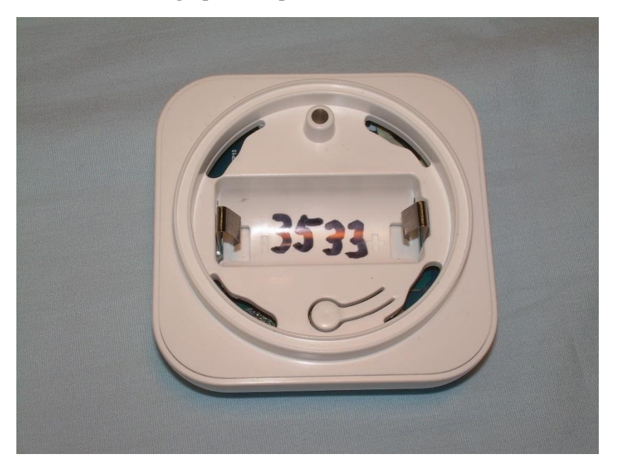
Photograph 2 – Top and Battery Removed from the EUT