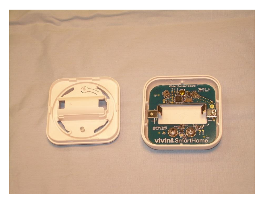
Photograph 3 – Middle Housing Removed