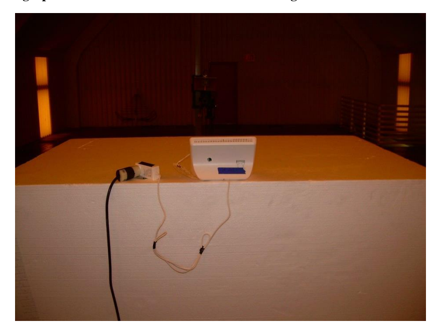
Photograph 4: Back View Radiated Emissions Configuration – Below 1000 MHz