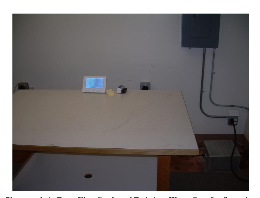
Photograph 6 - Front View Conducted Emissions Worst Case Configuration