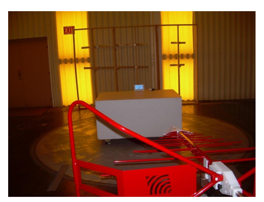
Photograph 1: Front View Radiated Emissions Configuration -30-1000\ MHz