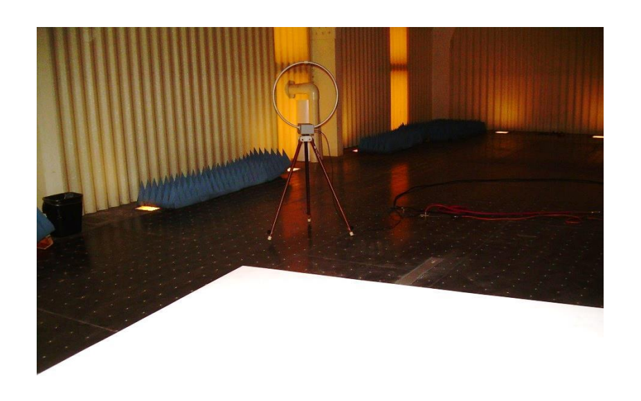
Photograph 5: Loop Antenna Setup Used for Frequencies Below 30 MHz