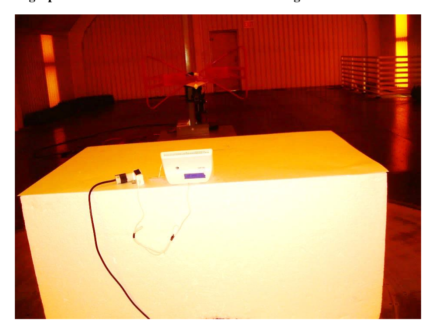
Photograph 2: Back View Radiated Emissions Configuration -30-1000\ MHz