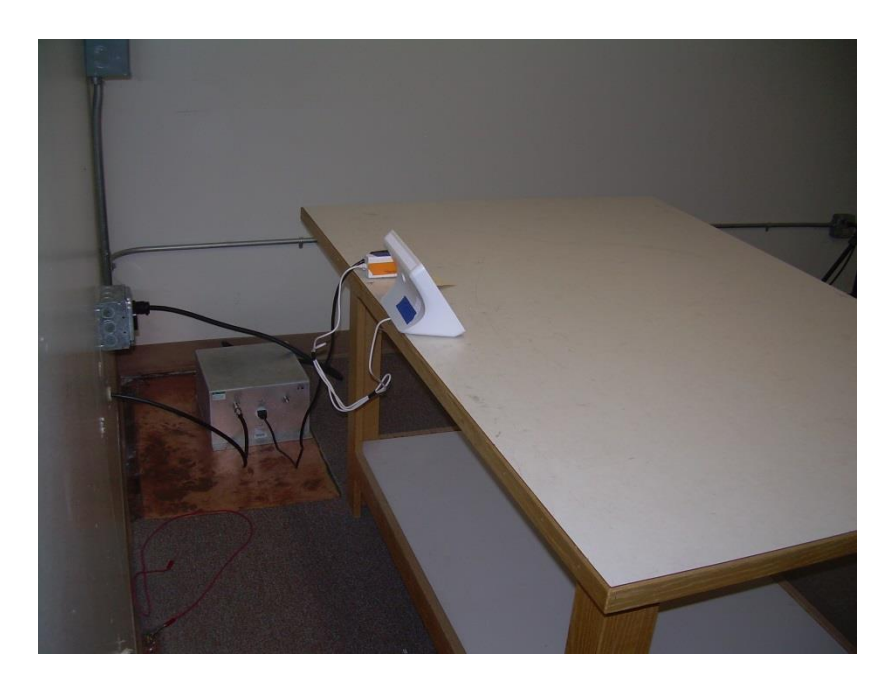
Photograph 7 - Back View Conducted Emissions Worst Case Configuration