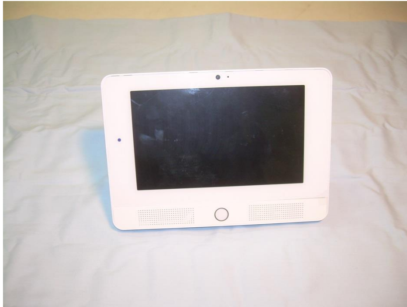
1. Front View of the EUT