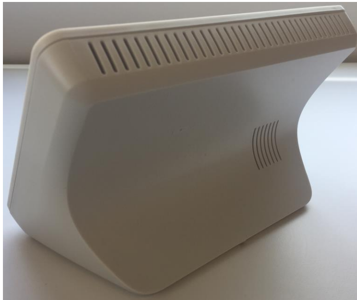
4. Rear View of the EUT