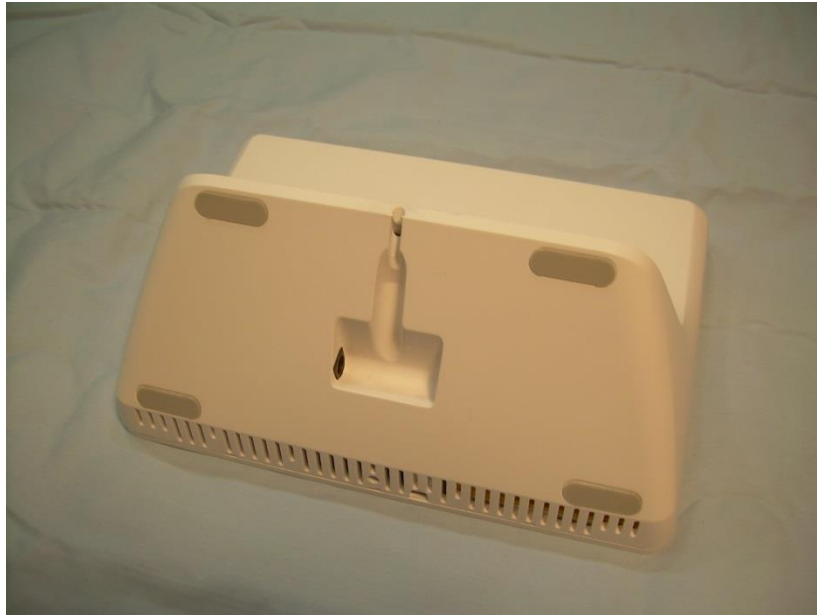
5. Bottom View of the EUT