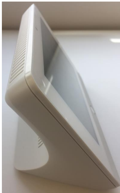
2. Left View of the EUT