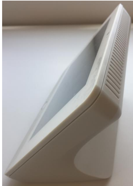
3. Right View of the EUT