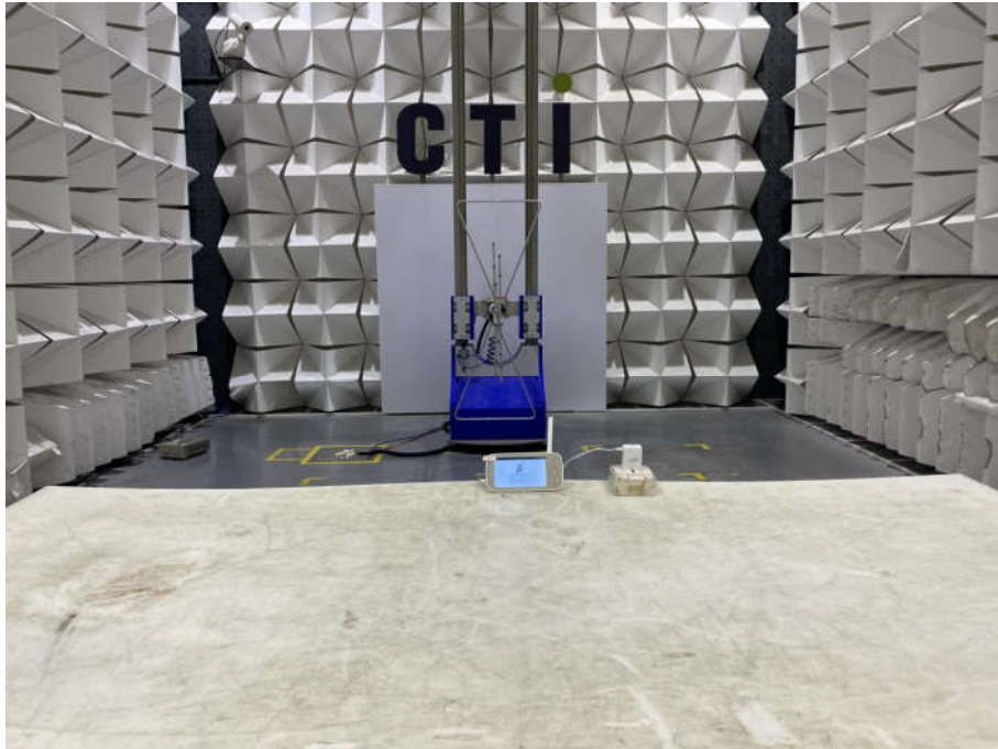
Radiated spurious emission Test Setup-2(Below 1GHz)