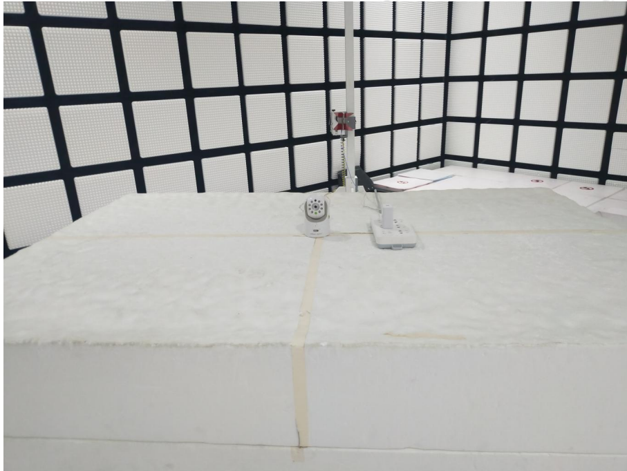
Radiated spurious emission Test Setup-3(Above 1GHz)