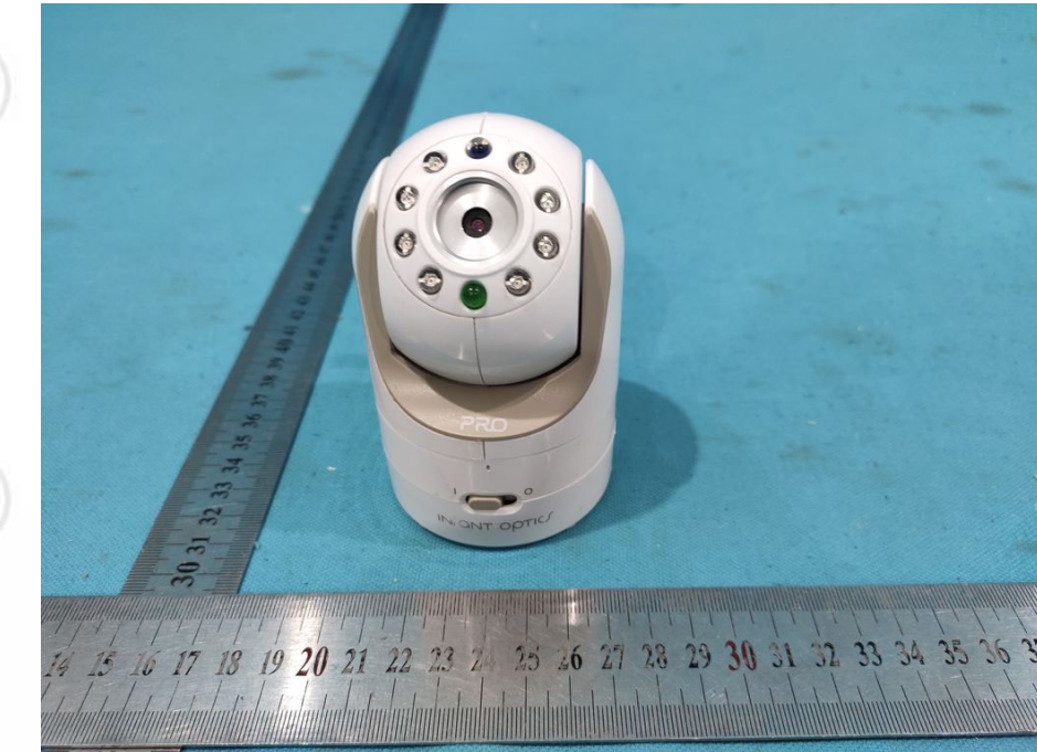
View of Product-3