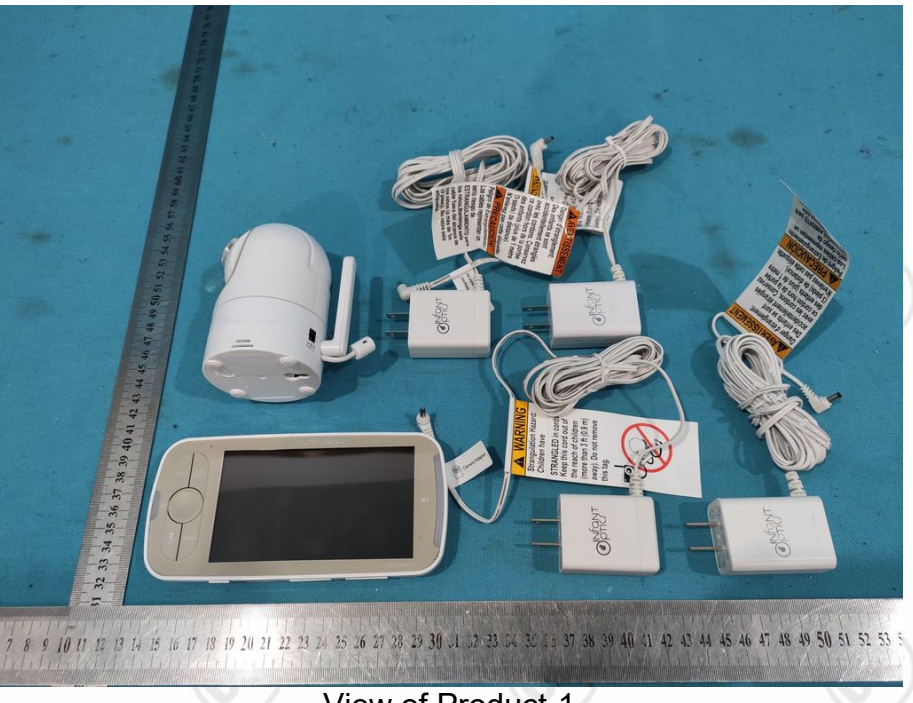
View of Product-1