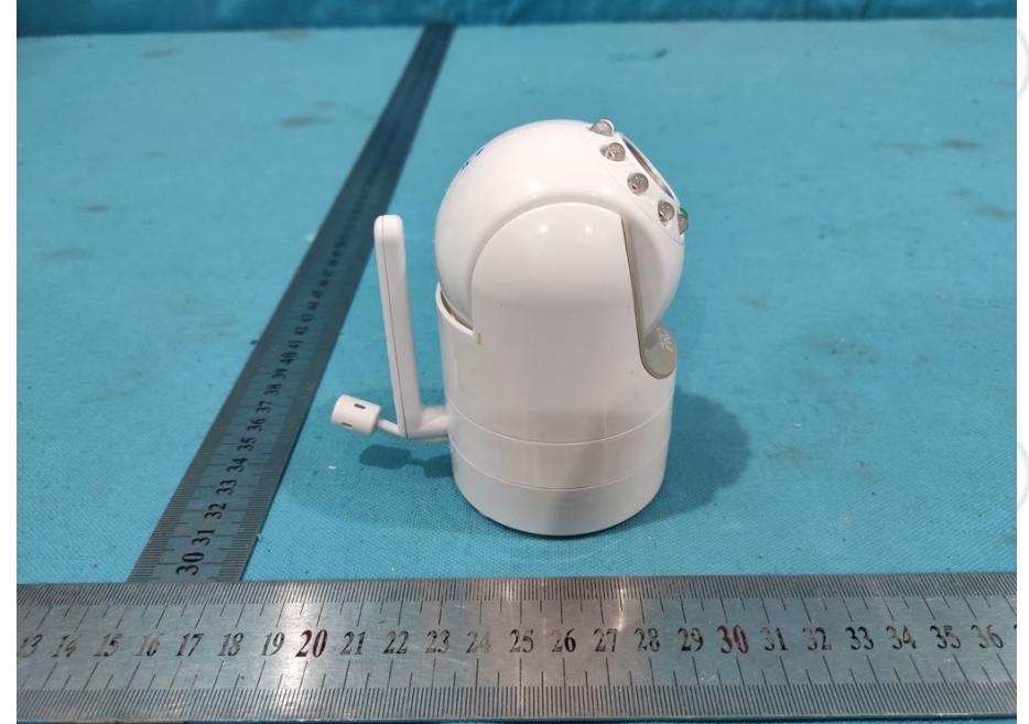
View of Product-5