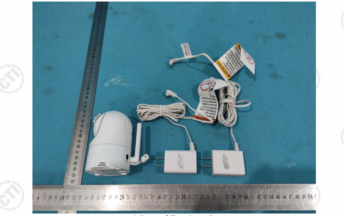
View of Product-2