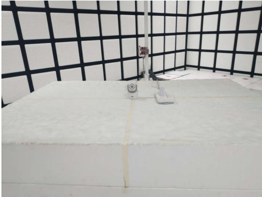
Radiated spurious emission Test Setup-3(Above 1GHz)