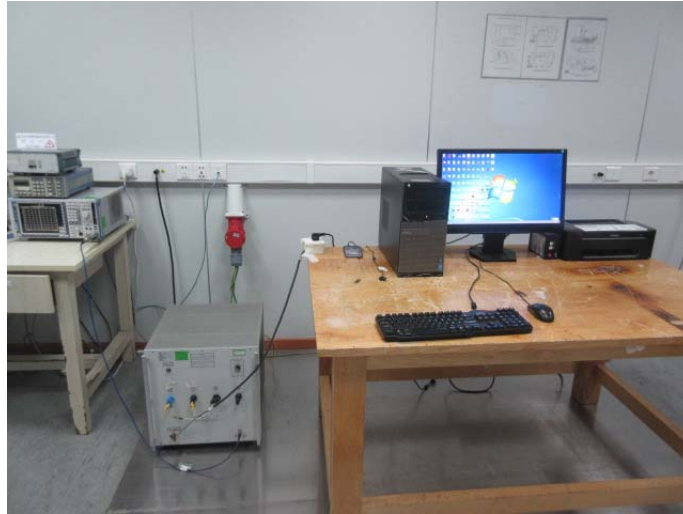
Radiated Emission (30MHz-1GHz) Connect to PC