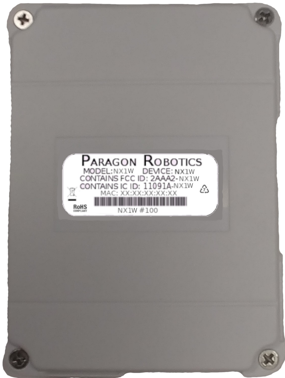
Figure 4: Label on bottom of case, Whip Antenna