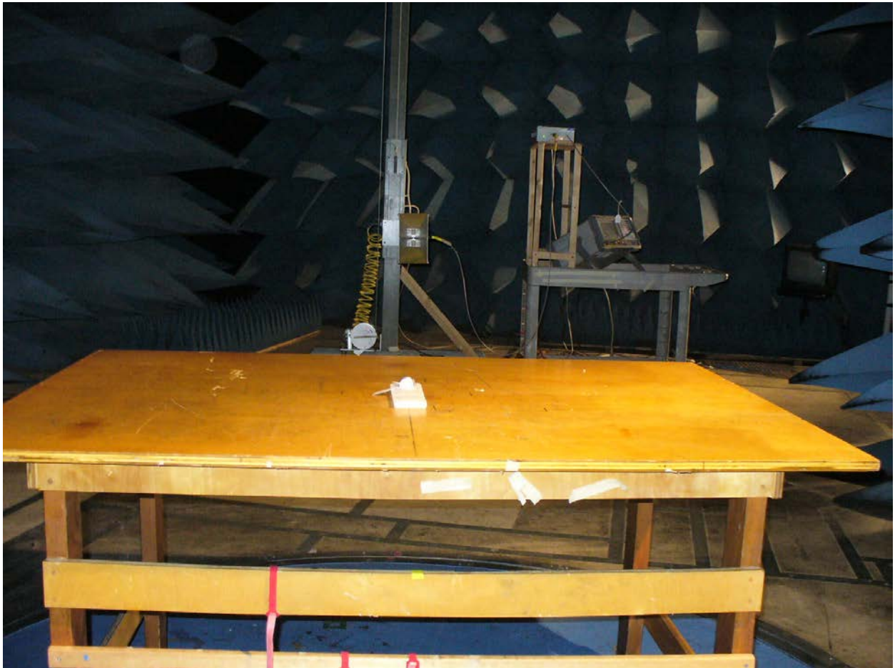
Figure 2: Radiated Emissions – Back View