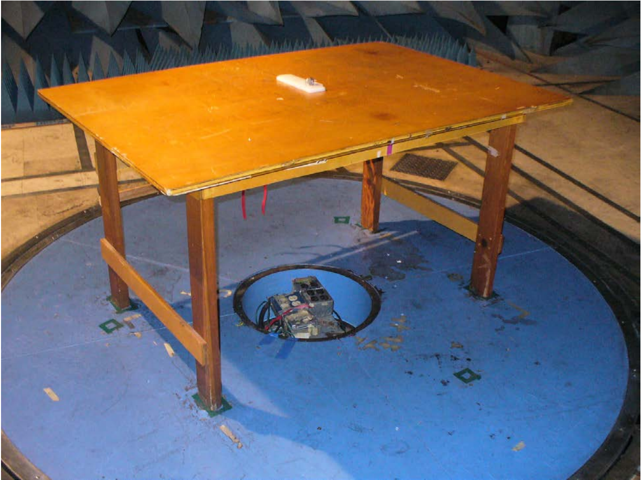
Figure 1: Radiated Emissions – Front View