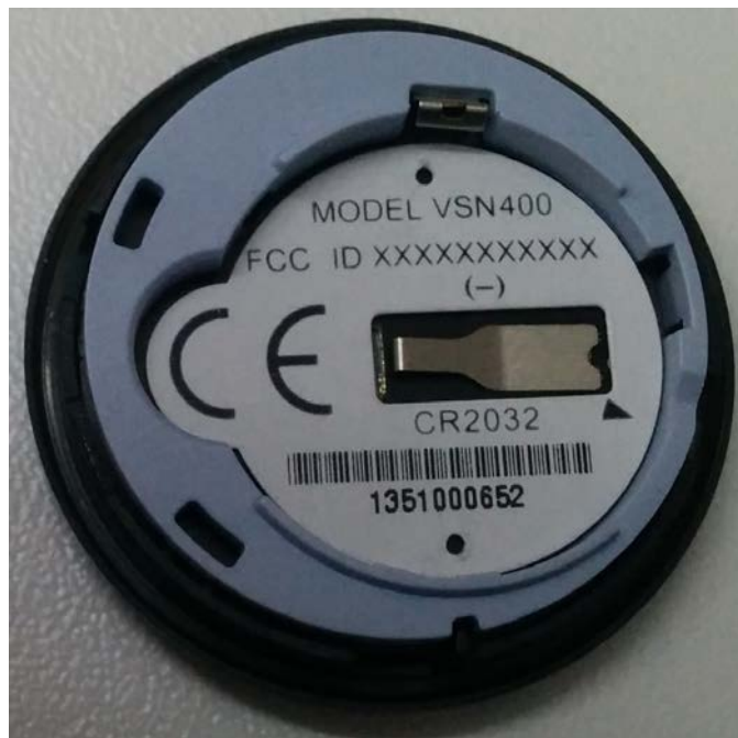
Figure 2: Sample Label Location