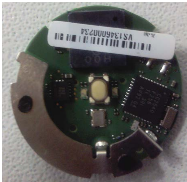
Figure 1: PCB Front View