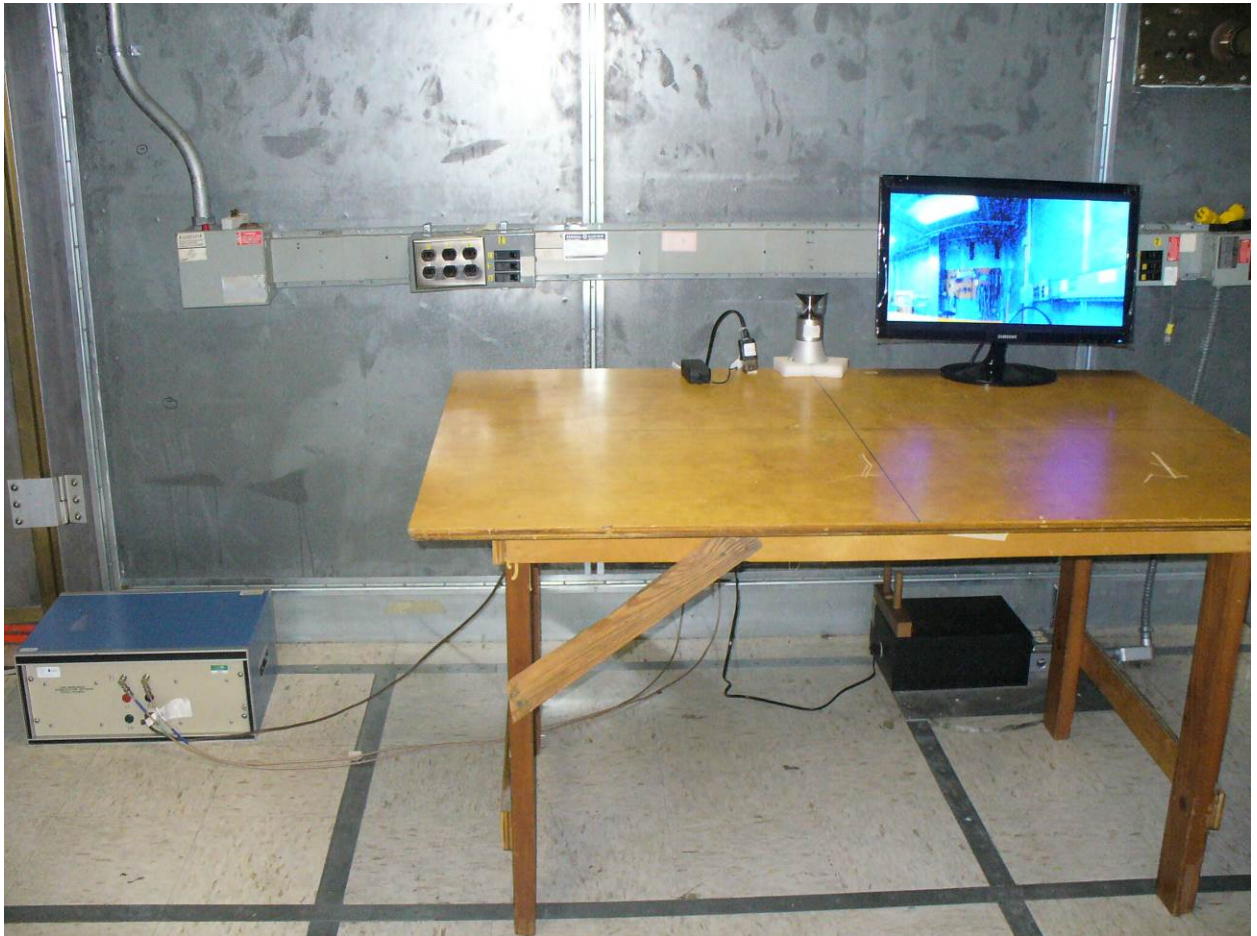
Figure 3: Power Line Conducted Emissions Test Setup – Front View