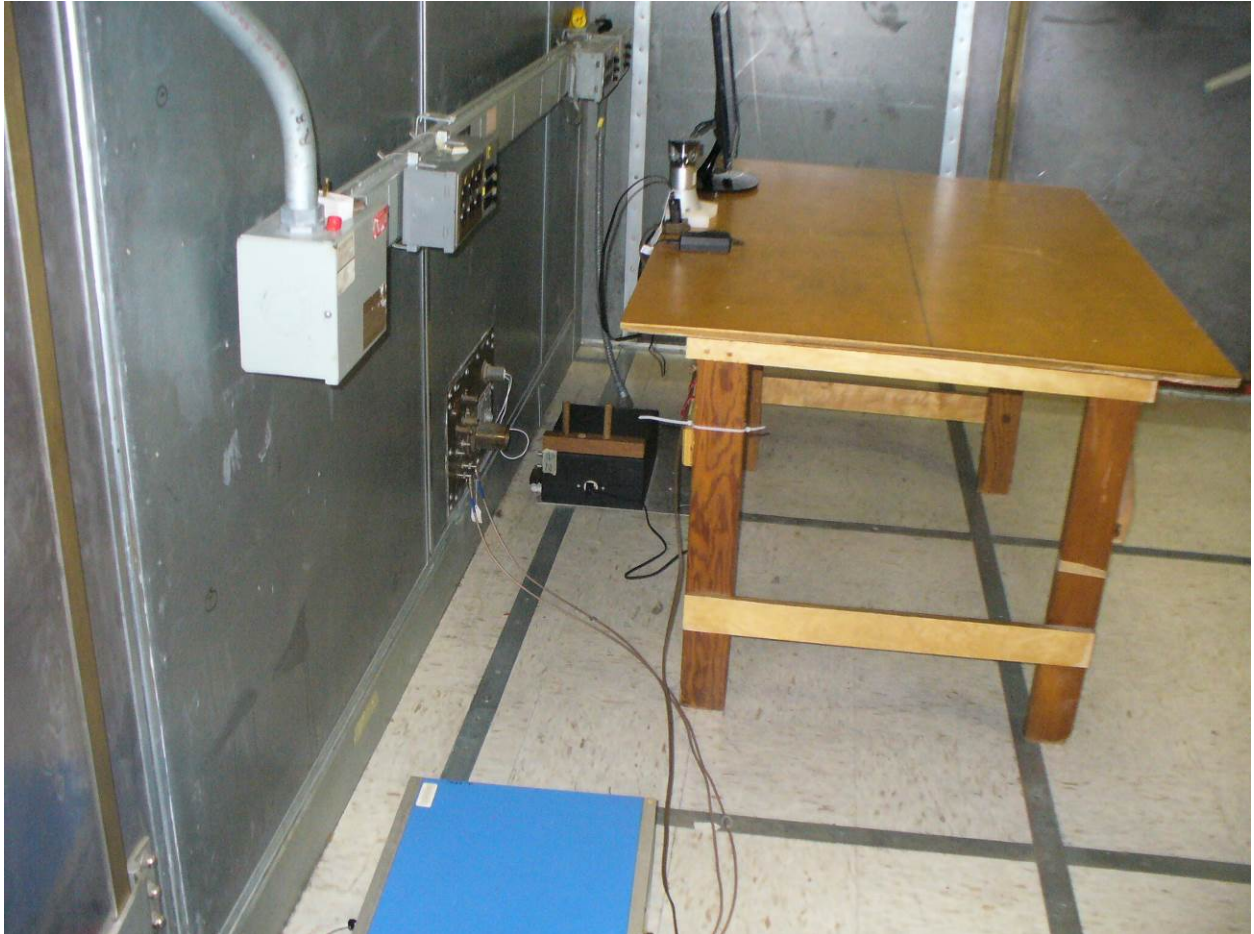
Figure 4: Power Line Conducted Emissions Test Setup – Side View